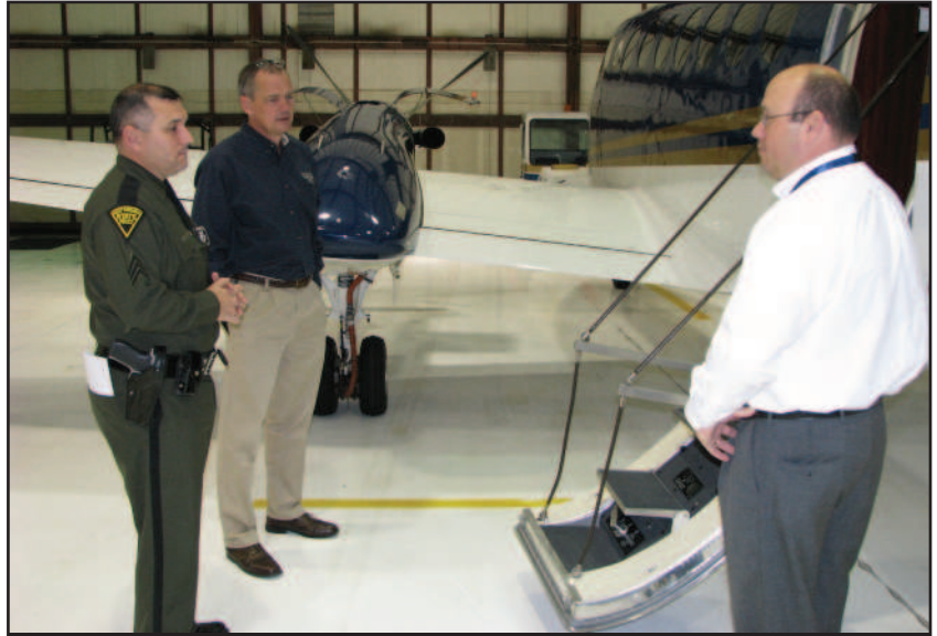
Members of the Governor's security detail and of the Aviation Division discuss issues during the division's annual Aviation Safety Day.