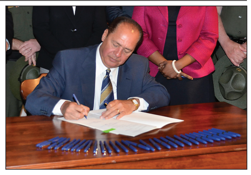
Gov. Earl Ray Tomblin signs a bill into law following passage by the 2013 Regular Session of the State Legislature.

HB 2652: Authorizing the Department of Administration to promulgate legislative rules for State Owned Vehicles, Design-Build Procurement Act and the Consolidated Public Retirement Board.