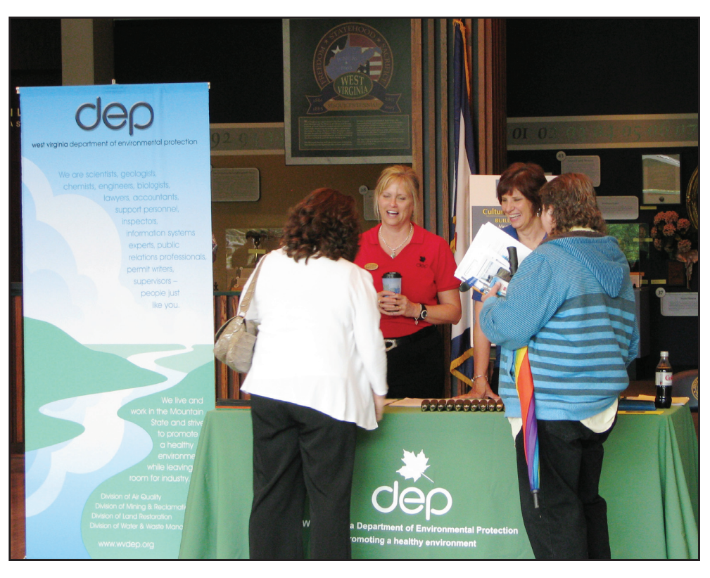
Above, representatives from the Department of Environmental Protection speak to attendees during the West Virginia State Government Career Fair at the Great Hall inside the Culture Center at the Capitol campus.

"Another aspect of this Career Fair was to show the many diverse job opportunities available throughout state government and its benefits, such as the comprehensive benefits package. The benefits include health insurance and retirement options," she said. "We are planning to contact each and every one of the applicants and make certain that they become familiar with the process of applying for state gov-