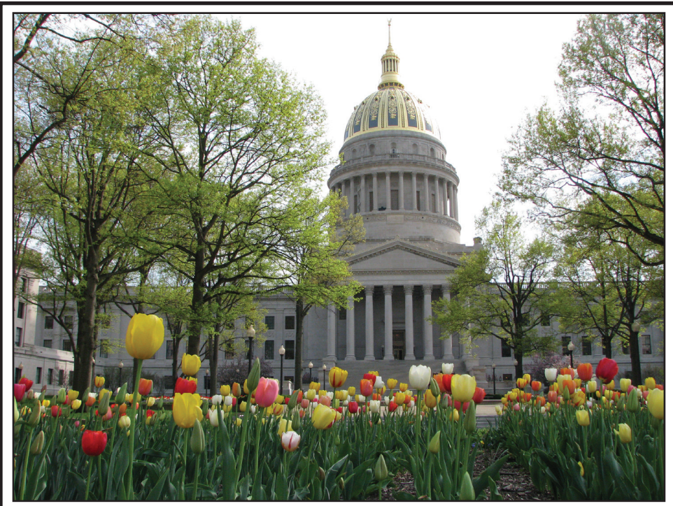
The Capitol campus continues to be awash in spring colors. The Grounds Unit of the General Services Division planted 40,000 tulip bulbs and 8,900 pansies last fall, which sprouted throughout April. At the end of last month, another 5,600 annuals and 1,200 perennials were planted to keep our complex colorful throughout late spring and summer.