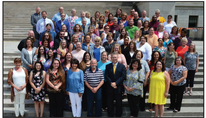
CPRB (above), the Finance Division (below), and BRIM (not pictured) were among 10 entities in West Virginia recognized for their excellence in financial reporting by the Government Finance Officers Association.

The GFOA is a major professional association servicing the