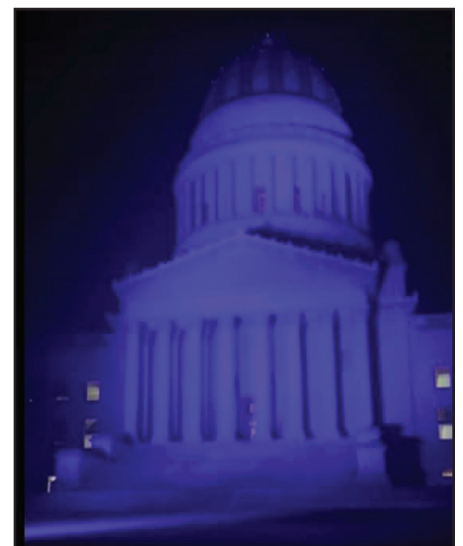
Quotes, Notes and Anecdotes

The original Purple Heart was established by George Washington in 1782 when he was the Commander-in-Chief of the Continental Army, but it wasn't until after World War I that the award earned worldwide recognition. More than 1.8 million Purple Hearts have been awarded to service members nationwide as of August 2022, according to the Department of Defense.