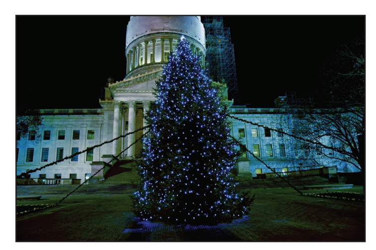
Each year, the General Service Division transports, decorates, and displays trees on the north and south plazas of the Capitol Campus as part of the holiday season. Planning for this project begins in the summer.

If you or someone you know would be interested in donating a tree, please contact the GSD Service Desk at 304.352.5483.