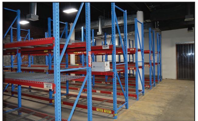
The new State Records Center opened March 1, 2023.

Every agency that has records to be stored in the State Records Center is asked to designate an employee with knowledge of the agency's records, to review those records currently in storage during the