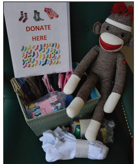
The Department of Administration collected new socks for the United Way as part of its Sock-tober campaign.

Last year, the United Way of Central West Virginia assisted 79,025 individuals, including 14,882 children. Past campaigns in West Virginia have been just as successful, and state employees are encouraged to give again this year. Go to www.unitedwaycwg.org/give-now for ways to donate.