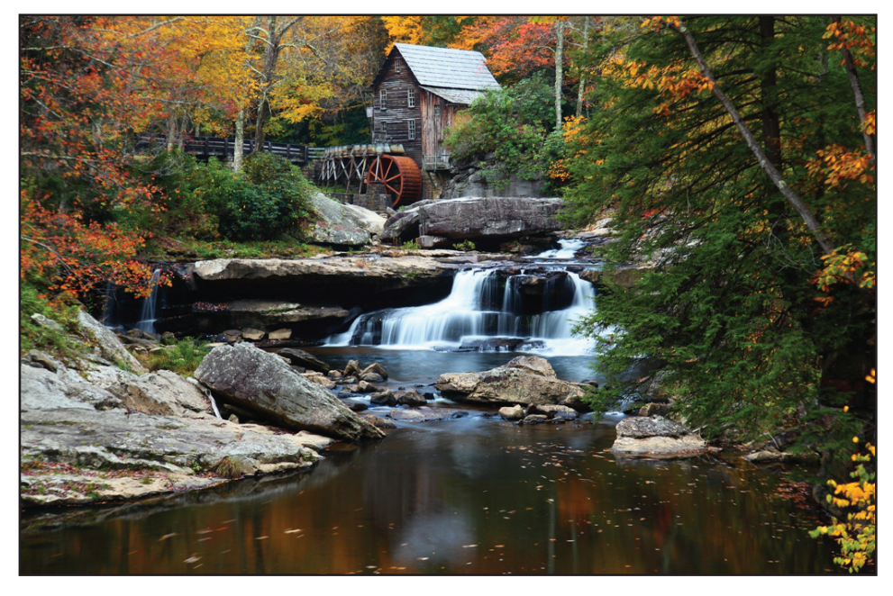
West Virginia is the third most forested state in the country, according to forestry officials. This means a wide variety of areas to visit for those interested in the changing colors of autumn.

As fall moves in and the amount of daylight shortens, the process is apparent through the leaves change of color. Less sunlight contributes to a drop of temperature, which hinders the plant's production of chlorophyll, the chemical which colors leaves green. As the