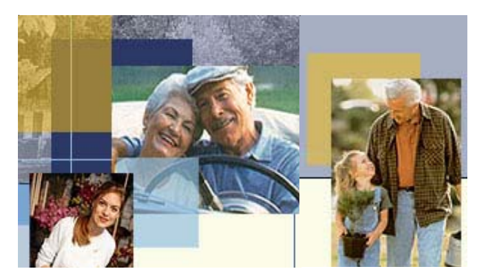
PEIA offers a new cessation benefit plan for those members wanting to kick the habit.

Try to make quitting tobacco YOUR new year's resolution. Quitting is important for your health, your family, and your wallet. Members of the Public Employees Insurance Agency (PEIA) now have access to a free smoking cessation program - the Free & Clear® Quit For Life Program.