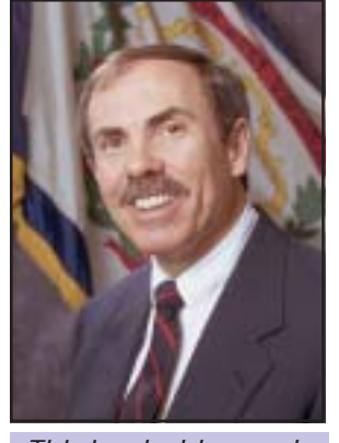
This is a bold agenda in tough times, but my inspiration and my guide are our West Virginia people. We will leave our children a great legacy if we unite for the entire state and place this government on a sound footing.