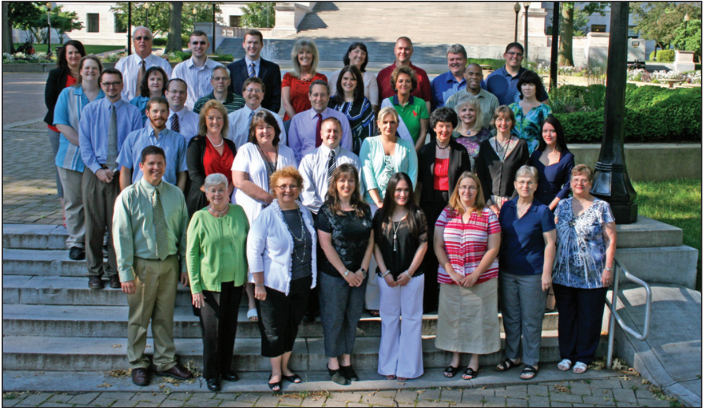
The Purchasing Division, pictured in this June 2013 staff photo, marks its 80th anniversary in 2013, following the creation by Executive Order of the Department of Purchases in 1933 by then-Governor George Kump.