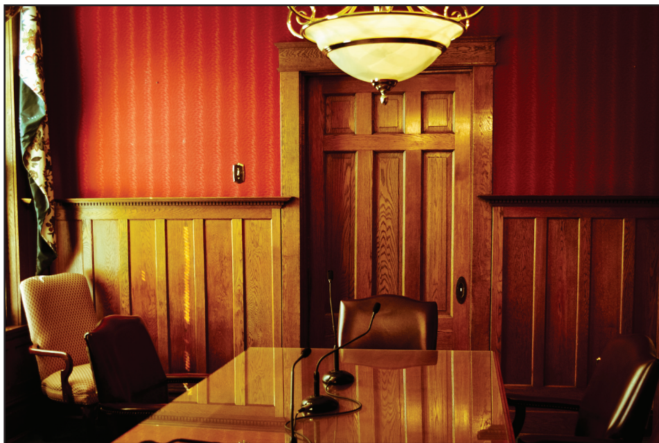
The hearing room at the West Virginia Public Employees Grievance Board of office is where the agency’s Administrative Law Judges administer decisions regarding public employees after a great amount of thought and deliberation.

ture passed the West Virginia Public Employees Grievance Procedure law “to provide a procedure for the resolution of employment grievances raised by public employees” with a goal of resolving them “in a fair, efficient, cost-effective and consistent manner ...”