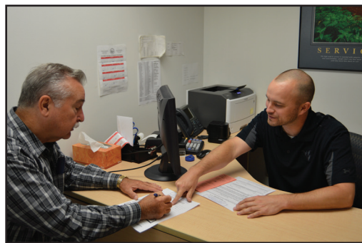
A CPRB retirement advisor discusses retirement options with a state employee.

PERS members wanting more information can visit the CPRB website at www.wvretirement.com . Members may also schedule an appointment with a retirement advisor by calling 304.558.3570 or sending an e-mail to CPRB@wv.gov .