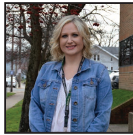
Crystal Rink February Recipient