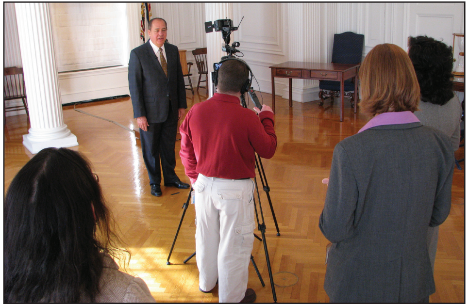
Gov. Earl Ray Tomblin records a video introduction for the “New Employee Orientation: Welcome to West Virginia State Government,” an online orientation module for new state employees offered by the Division of Personnel’s Organization and Human Resource Development section.