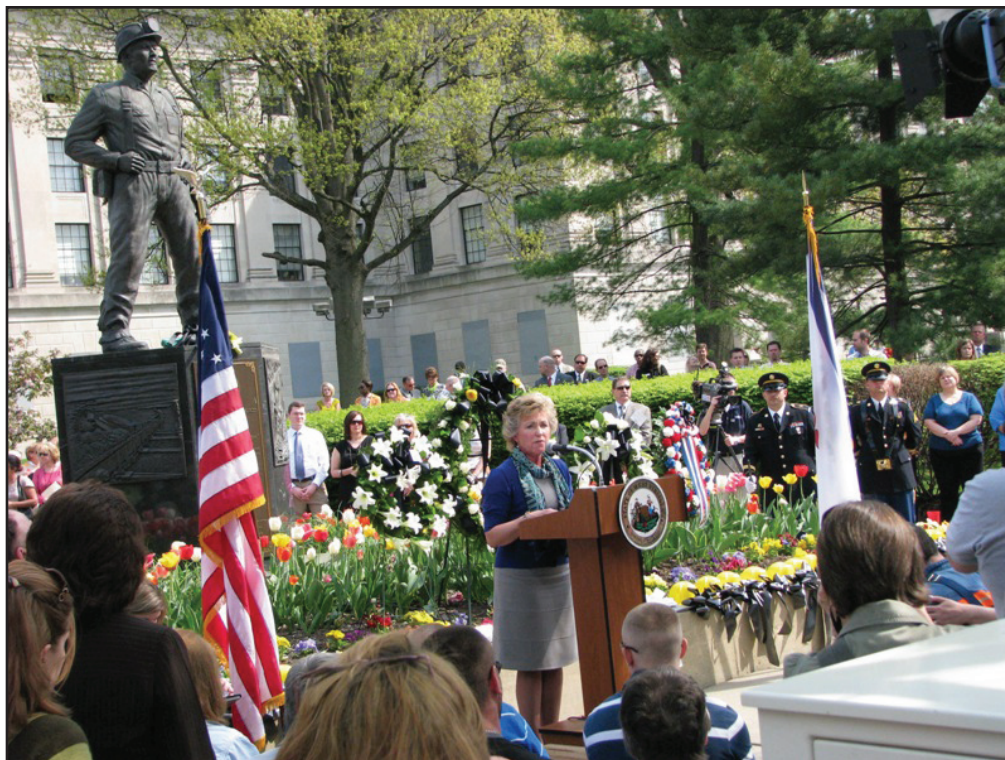
[Above] First Lady Gayle Manchin speaks to the family members of the miners killed and injured in a Raleigh County mine explosion during a wreath-laying ceremony at the Coal Miner Memorial statue on the Capitol Grounds on April 12. Part of the commemoration was Governor Joe Manchin's call for a national moment of silence that day. Twenty-nine miners were killed and two injured in the April 5th tragedy.