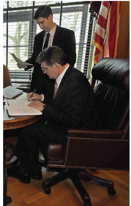
Governor Joe Manchin reviews bills passed during the 2010 Regular Session of the State Legislature.