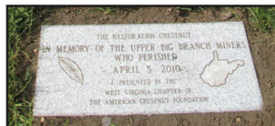
Governor Joe Manchin is joined by local Boys Scouts and elementary school children in planting an elm tree on the Capitol grounds for Earth Day on April 22. A memorial plaque dedicated to the coal miners who perished in a Raleigh County mine explosion in April is placed next to the elm tree.