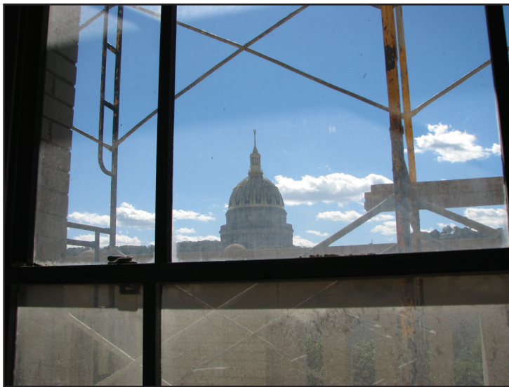
Building 3’s windows will maintain their bronze frames following the building’s renovation. Efforts will instead focus on modernizing them to make them more energy efficient.

for the perimeter security project are a new security fence expected to enclose the Governor’s Mansion, a new bus turnaround and handicapped parking lot adjacent to the Culture Center, and a welcome sign which will be erected on Greenbrier Street.