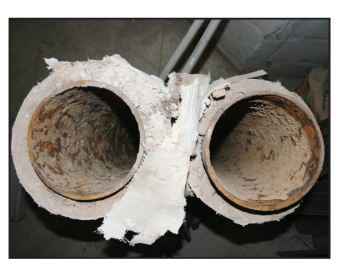
Contactors installing the new HVAC system throughout the Capitol are replacing worn, corroded pipes such as these.

"Everybody in the State Capitol has been exceptionally patient with us. It is a real challenge to do a renovation project of this magnitude while people are still working in the building," he said of the multi-year project that began less than a year ago. "Add in the historical