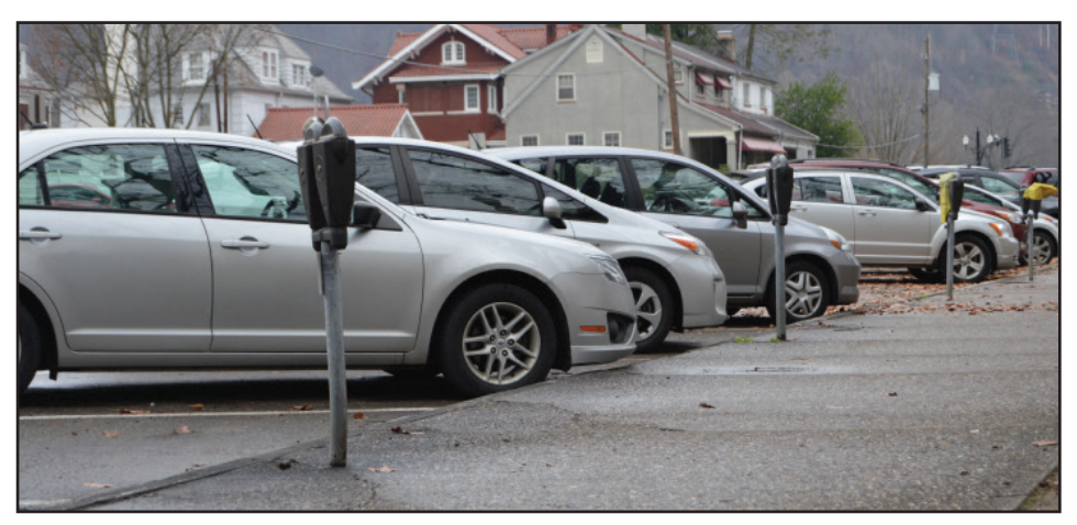
With the 2016 Legislative Session scheduled to begin on January 13, parking challenges are to be expected around the Capitol campus.

With the 2016 Legislative Session fast approaching, the Real Estate Division's Parking Section would like to remind employees of its parking regulations. The 60-day session kicks off January 13, and with it, a much greater demand for parking around the Capitol campus.