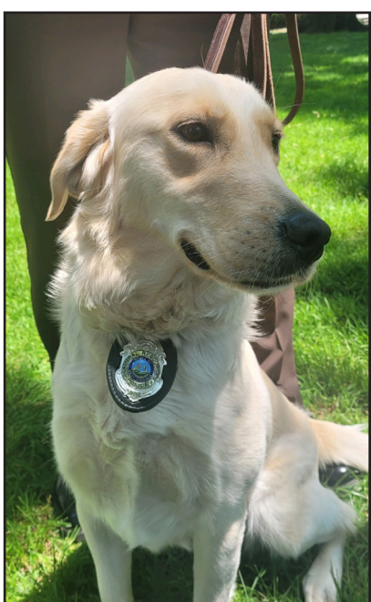
Quotes, Notes and Anecdotes