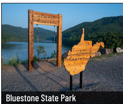
Bluestone State Park

Take a breath of fresh mountain air while gazing upon the tranquil waters of Bluestone Lake. Retreat for a solo rejuvenation or bring along your family and friends to stay in one of the on-site cabins, equipped to accommodate up to eight people.