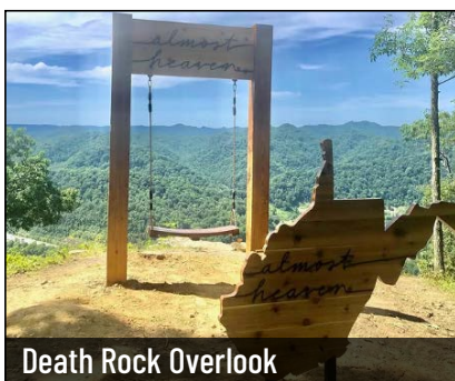
Death Rock Overlook

Hit the Hatfield-McCoy Trail System for an off-roading adventure and discover one of the most unique swing locations. Travel along Buffalo Mountain Trail to reach Death Rock Overlook, where this swing overlooks the town of Williamson below.