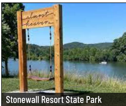
Stonewall Resort State Park

Overflowing with Civil War history, Droop Mountain Battlefield State Park is also home to some of the most magnificent dark skies on the East Coast. Visit after sunset to experience a panoramic view of the natural nighttime twinkle. Turn your day into a stay with one of the many on-site cabin options.