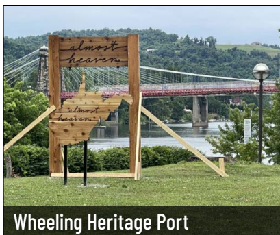
Wheeling Heritage Port

Located just off the walkway to the Ohio River, this swing boasts views of the iconic Wheeling Suspension Bridge. Stroll or bike along the riverfront path, enjoy a picnic dinner, and watch the pastel skies from this spectacular photo op.