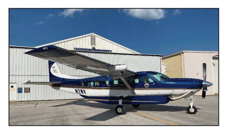
The West Virginia State Agency for Surplus Property is responsible for the retirement of many state government assets. This summer, it facilitated an auction to sell the state's 2009 Cessna 208B Grand Caravan for more than $1.5 million.

"I hope the successful auction of this plane encourages state agencies to contact us with questions about our process and feel