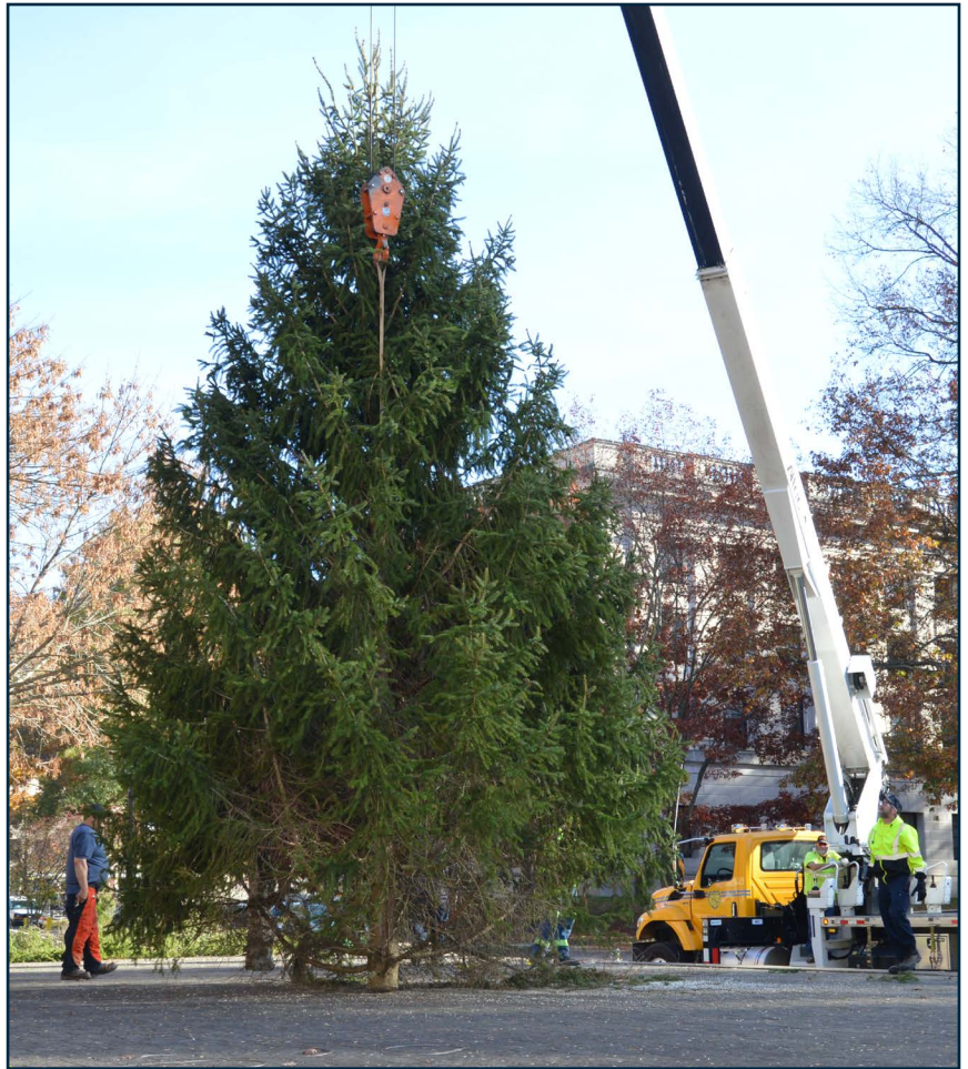
This photo from last year shows workers carefully erecting one of the Capitol holiday trees, a West Virginia-grown spruce donated by a local resident. Each year, this tradition showcases the natural beauty of our state and the generous spirit of those who contribute to making the season bright.

If you or someone you know would be interested in donating a tree, please contact the GSD Service Desk at 304-352-5483.