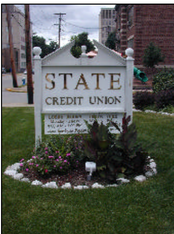
The State Credit Union is located at 2200 Washington Street, East, in Charleston.

[Source: Pathways to Wellness, “How to Put the Brakes on Stress” ]