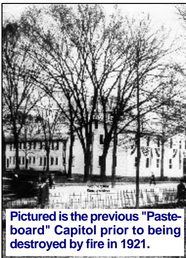
Pictured is the previous "Pasteboard" Capitol prior to being destroyed by fire in 1921.

Editor's Note: This is the second of a two-part series targeting how the State Capitol and its grounds have changed throughout history.