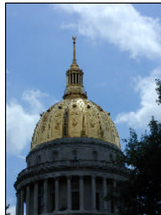
(Below) The gold dome is one of the facets which makes our State Capitol unique.

Quotes, Notes & Anecdotes is published by the Department of Administration