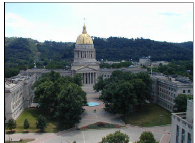
(Top) Steven Rotsch, the Governor's photographer, took this aerial view of the State Capitol Complex.