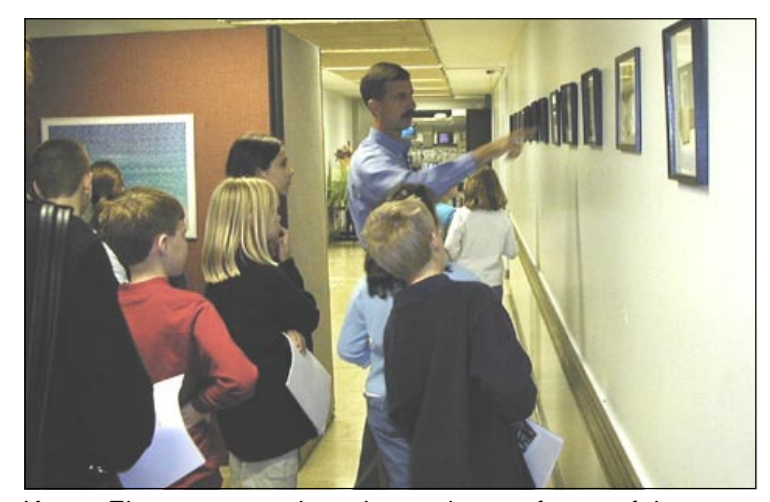
Kenna Elementary students learned many facets of the computing world at IS&C's Data Center "Open House".

In the past, large mainframe computer systems filled the center to capacity; however, today the equipment is smaller and more efficient. IS&C is storing more data with its enterprise server that takes up less space but processes much more, holding up to three terabytes (one trillion bytes of information).