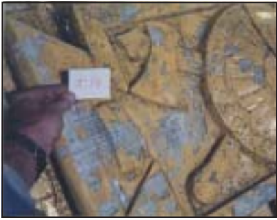
This picture demonstrates some of the surface damage that appears on the dome of the State Capitol.

"You won't see much difference from the structural repairs, because that's all inside work," Burgess said. "The gilding process will take place during or shortly after repairing of the structure."