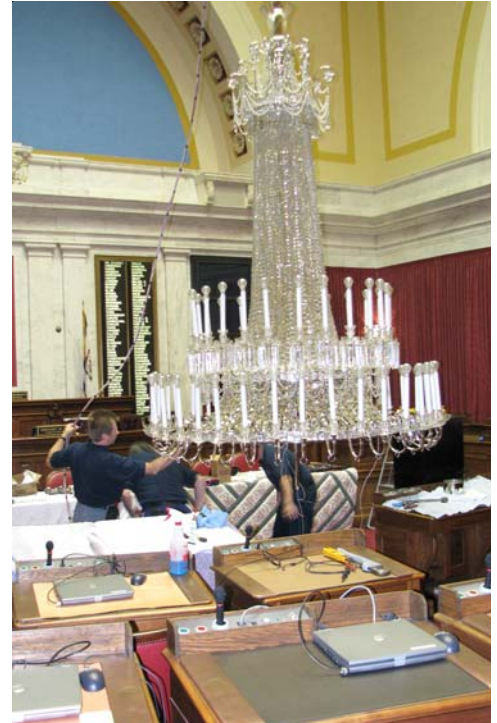
The newly restored chandelier is pictured being installed in the House Chamber.

In September of this year, the chandelier in the Senate Chamber was restored and installed. Recently, the restoration of the chandelier in the House Chamber was completed and installed. The final chandelier, which is expected to return in January, is to be installed in the Capitol Rotunda. This chandelier, which is the largest of the three chandeliers restored, is approximately twice the size of the crystal ball dropped in Times Square every New Year's Eve.