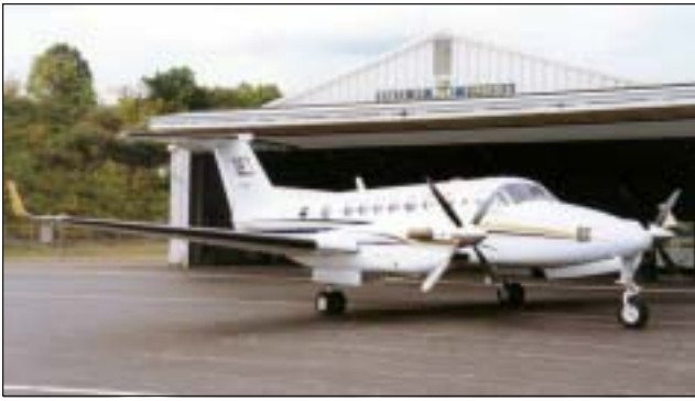
The state's aircraft is a Beechcraft King Air 350, which averages 345 mph.

When asked which of his works he would select as a masterpiece, architect Frank Lloyd Wright, at the age of 83, replied, "My next one."