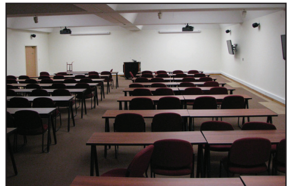
The Capitol Room in the Gaston Caperton Training Center was among four rooms remodeled in Building 7.

"When we started the project, we did not realize how intense it would