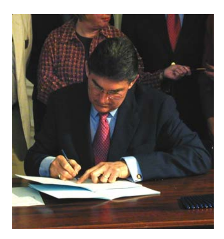
Gov. Joe Manchin III is pictured signing House Bill 2940 that increases the age of dependents for health insurance coverage to age 25.