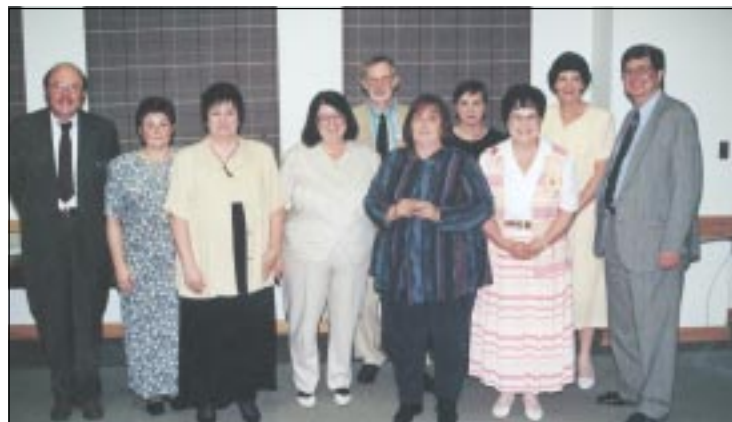
Department employees with 30 years of service