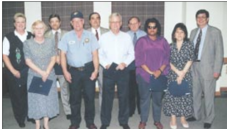
Department employees with 25 years of service