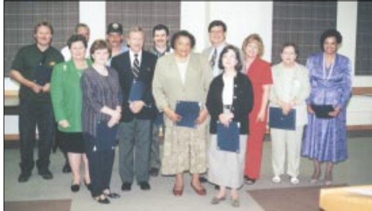
Department employees with 20 years of service