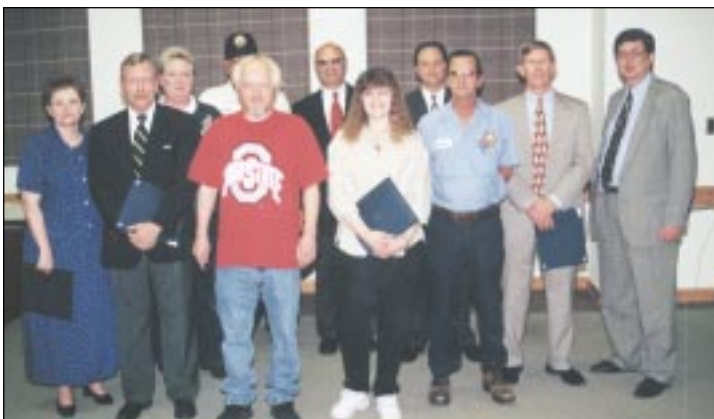
At the Department's Awards Ceremony, employees who did not take any sick leave during 1999 were recognized for their superior attendance.