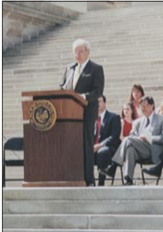
Governor Cecil Underwood kicked off Public Service Recognition Week, which celebrated the contributions made by state employees.

Cecil H. Underwood Governor, West Virginia