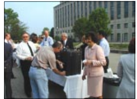
Governor Cecil Underwood joined his office staff during Public Service Recognition Week to offer morning refreshments to state workers.

With a variety of local activities, this national celebration was held from May 1 through May 5. In this issue of Quotes, Notes & Anecdotes , some pictures of the highlights are being shared with our readers.