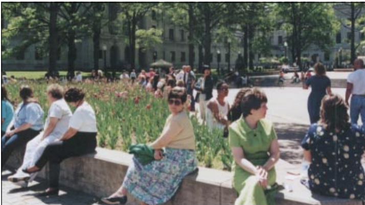
The weather certainly cooperated with the activities during this year's Public Service Recognition Week.