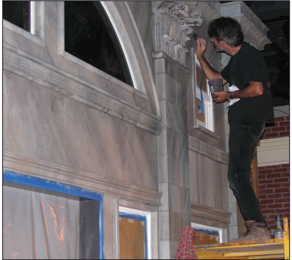
A worker places finishing touches on one of the building re-creations located throughout the State Museum located in the Cultural Center.

Proctor said the museum works on multiple levels, depending on your own knowledge of the state's past. "From the perspective of a visitor from outside of the state, they will be blown away by the depth and richness of the heritage of West Virginia and its people and its resources," she said. "As a native of the