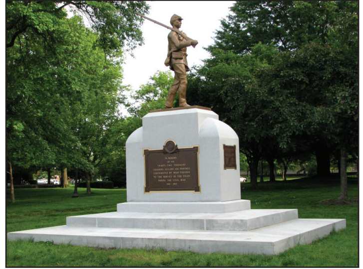
The Soldiers and Sailors Monument has returned to the south side of the Capitol lawn. A new granite foundation replaces the old cracked one (see left) and the Union soldier statue and four plaques were cleaned and restored to their original finish.