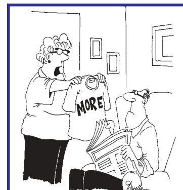
It's for Thanksgiving. Now, you won't have to talk with your mouth full.