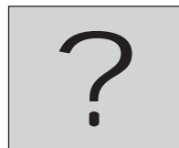
Not Selected December 2002