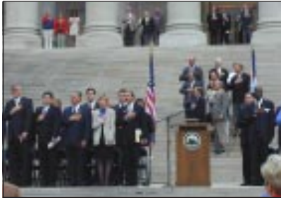
Governor Bob Wise coordinated a special prayer service on the Capitol grounds.

For most of us, we will vividly remember where we were, who we were with and what we were doing on September 11, 2001, the day that terrorists attacked our nation and left most Americans in shock and disbelief.