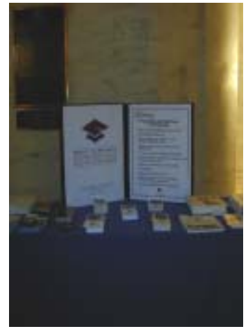
Exhibit tables were displayed in the Capitol Rotunda, detailing the programs and services offered by state agencies.

With the remembrance of the September 11th attacks of last year, Gov. Bob Wise organized a special ceremony to pay tribute to America, with special attention to those individual serving in our military forces. "We remember the innocents, who harmed no one, who lived the everyday dreams and promises with