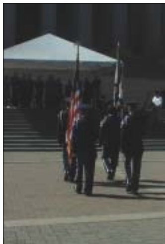
During the opening ceremony, the color guard proudly displayed the flags of the state of West Virginia and of the United States.

For this reason, an important part of our week-long celebration was the agency exhibits, that were displayed in the Capitol Rotunda.