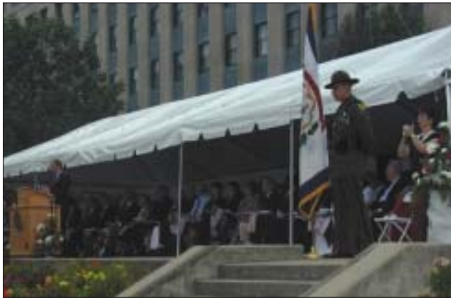
Governor Bob Wise led a special ceremony honoring the lives of those lost during the Sept. 11, 2001 attacks.