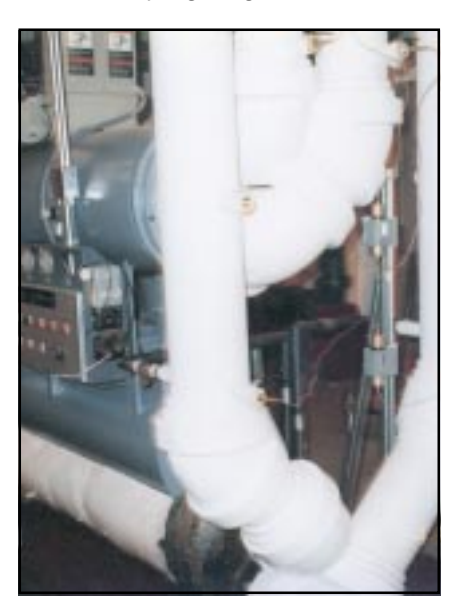
A Closer Look...The surplus chiller unit proved to be a great asset to the Charleston Area Medical Center.