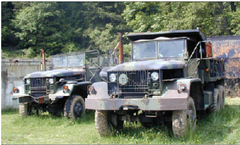
After the life expectancy runs out on these vehicles and the compliance period has concluded, they are still used for spare parts by the Bradley Public Service District.