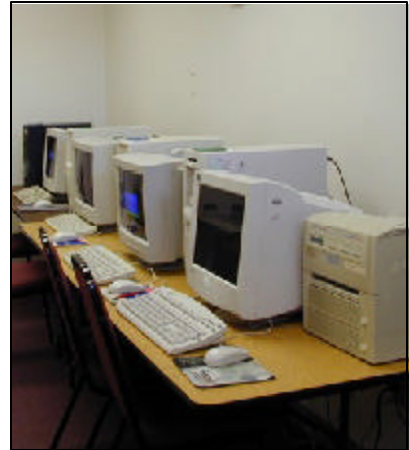
The Roane County Commission on Aging purchased nearly 50 computers used to teach computer classes to senior citizens.