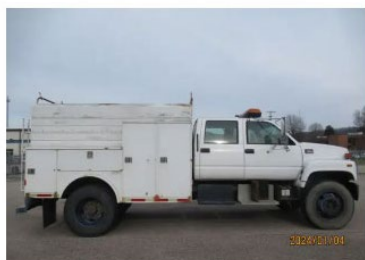
1999 GMC C7H042 - 2 Ton Conventional Cab (509919)